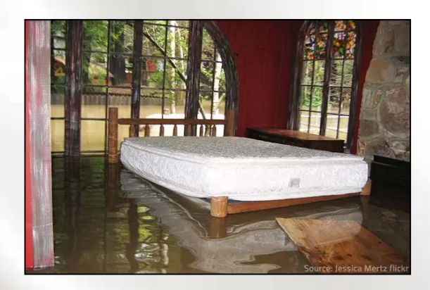
Flood, water damage, fire, etc.