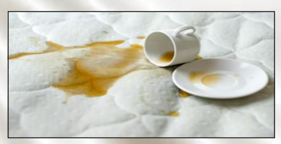
All Accidental Stains (Spot Removal)