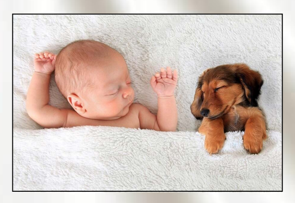
Human and pet bodily fluids