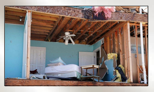
Hurricane, flood, fire, natural disasters